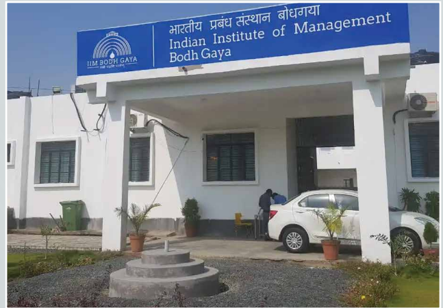
IIM Bodh Gaya