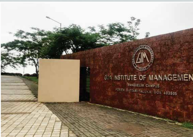
Goa Institute of Management